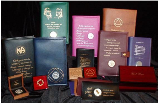
Culver Enterprises, Inc Products Overview

Culver Enterprises, Inc. 743 Porter Lane Grants Pass, OR 97527