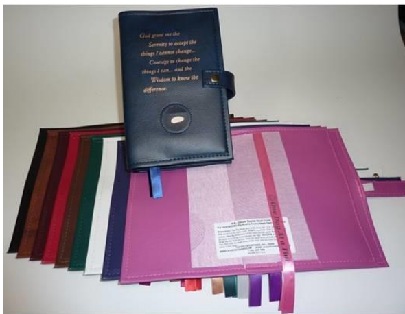
DDBAA07: Fits Big Book and 12&12 (Hardback Books) - 10 Colors