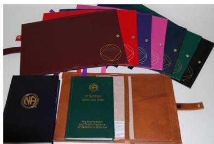
DDBNA609: 6th Ed Basic Text and It Works (Hardback Books) - 10 Colors Available.